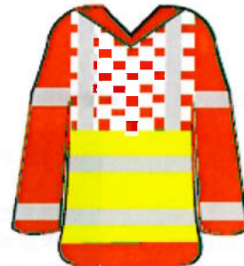
Cork City Council Controller