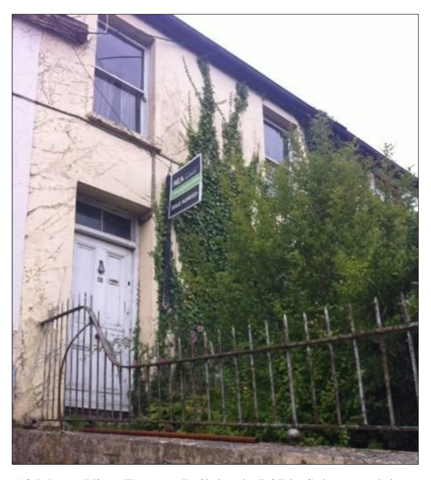
12 Mount View Terrace, Ballyhooly Raad: Sale agreed, have sought written undertaking and timeframe from prospective new owner.