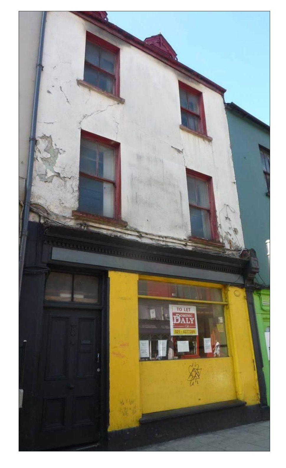
18 MacCurtain Street: Unsightly commercial premises.

I recommend that the Committee note the position and refer the report to An Chomhairle for approval.