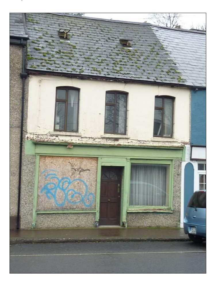
125 Lower Glanmire Road: The premises sold in recent months. The new owner is meeting with the Planning Department next week to discuss refurbishment proposals.