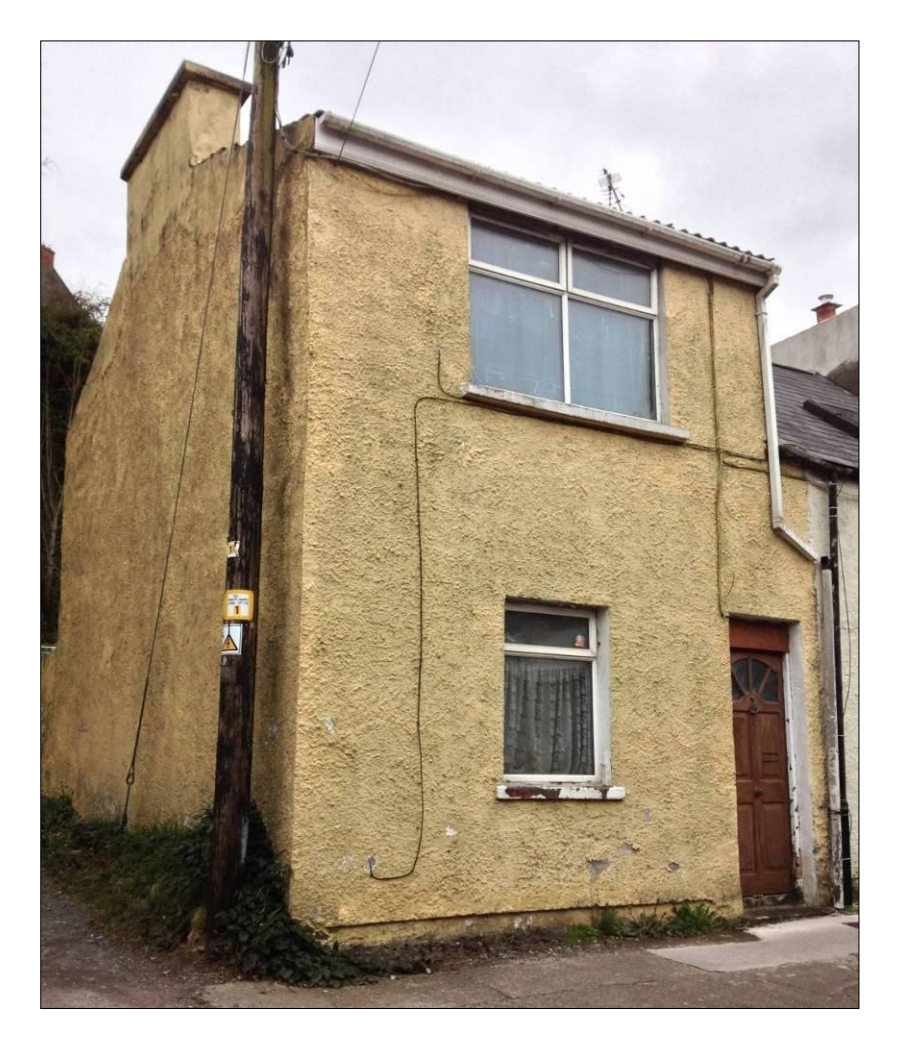
1 Windsor Cottages, off Ballyhooly Road: Estimated vacant for at least five years. Ownership investigation underway.