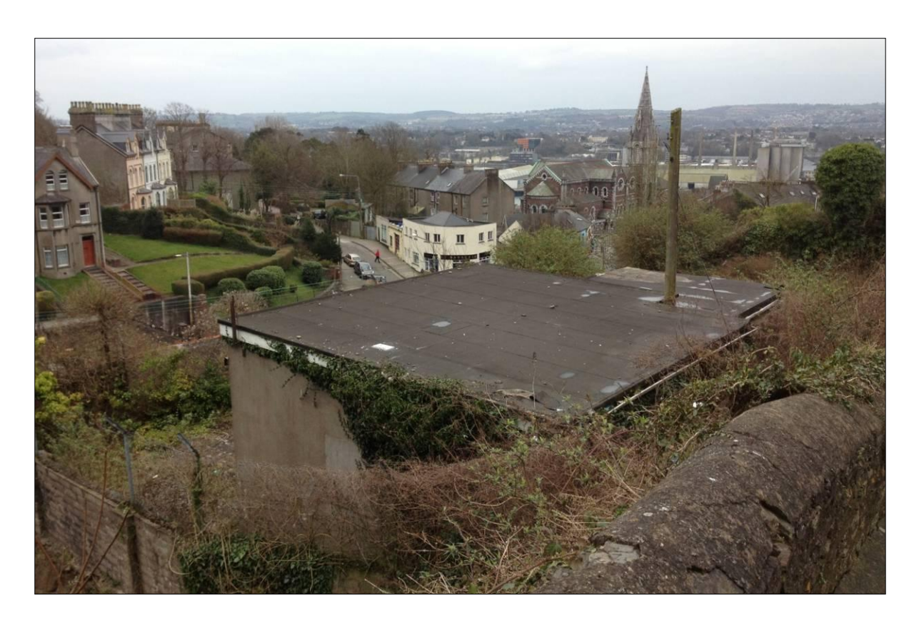
Alexandra Road, St. Luke's: Planning permission granted for three townhouses; the site is currently for sale.