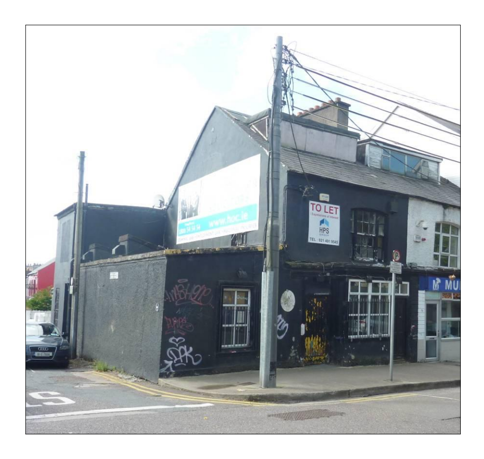
180 Old Youghal Road: New file; issued letter to owner requesting works be