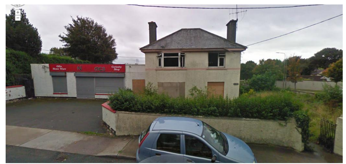
Deelish House: Placement on the Derelict Sites Register in September 2014.