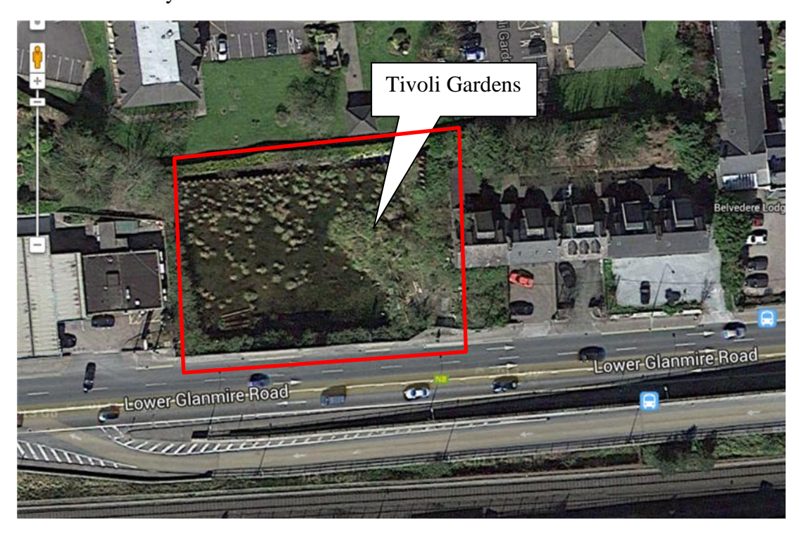
Former Texaco Garage Site, Lower Glanmire Road adjacent to Tivoli Gardens; sale agreed