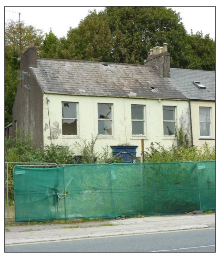
1 Tivoli Gardens, Lower Glanmire Road: Sale agreed; have sought written undertaking and timeframe from prospective new owner to carry out works immediately.