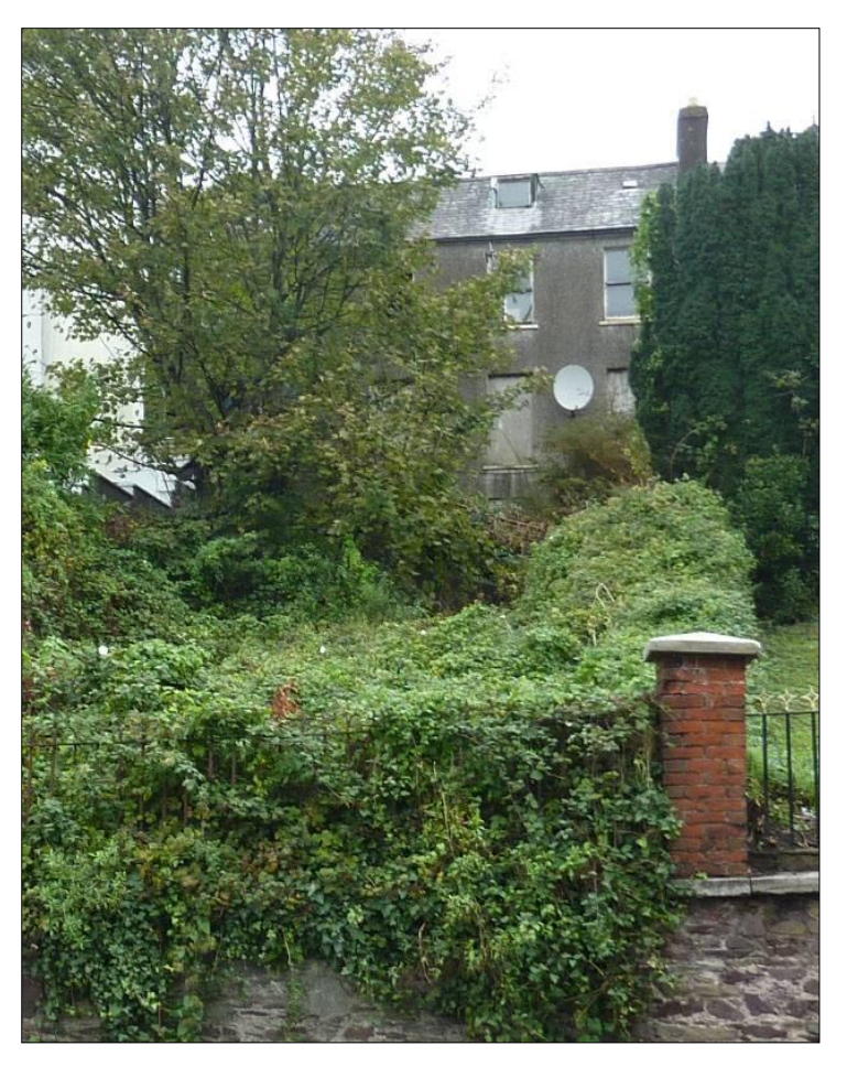
1 Adelaide Terrace, Summerhill North (site goes through to Wellington Road). Sale agreed; have sought written undertaking and timeframe from prospective new owner.