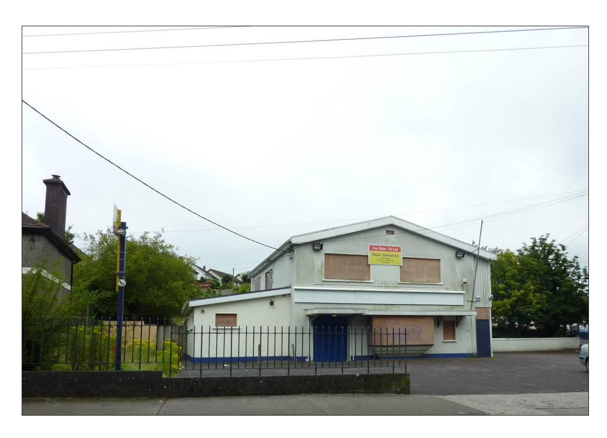
Former TSB Bank, Iona Park, Mayfield: Premises is sale agreed but title issue needs to be addressed before sale can close. The estate agent has advised that the prospective purchaser intends to occupy the building immediately upon completion of the sale.