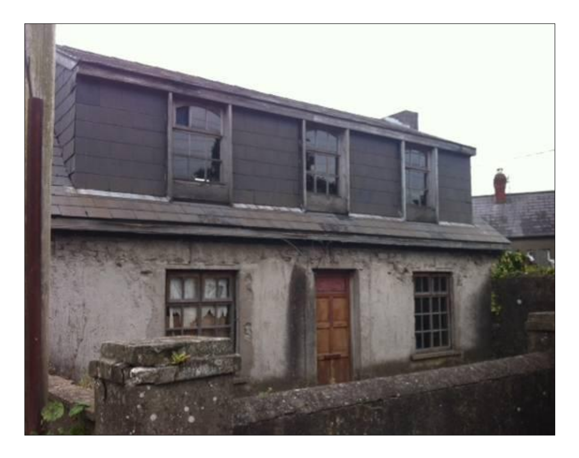
122 Gardiner's Hill: Estimated vacant for some 12 years. Some missing glazing, unfinished plasterwork, no rain water goods.