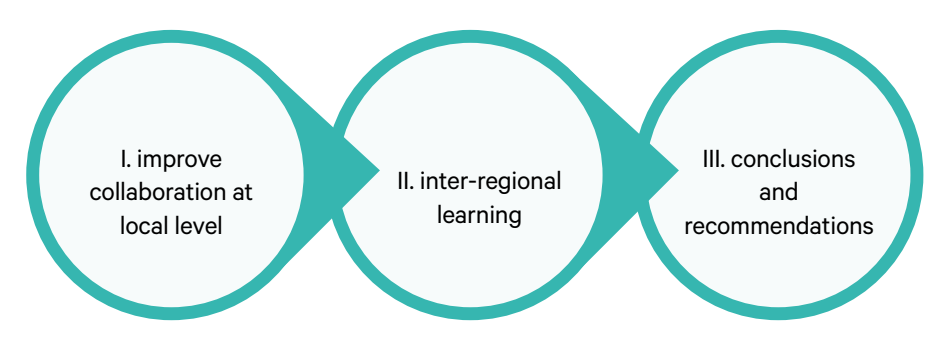
Figure 1: project stages

Partners also involved local policy makers and academic experts to support the event through presentations and participation in roundtable discussions.