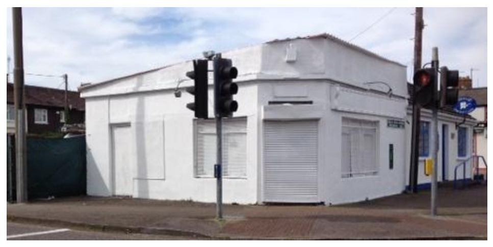
Wallace's Avenue/ Boreenmanna Road