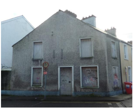
1 Evenus Ville, Albert Road