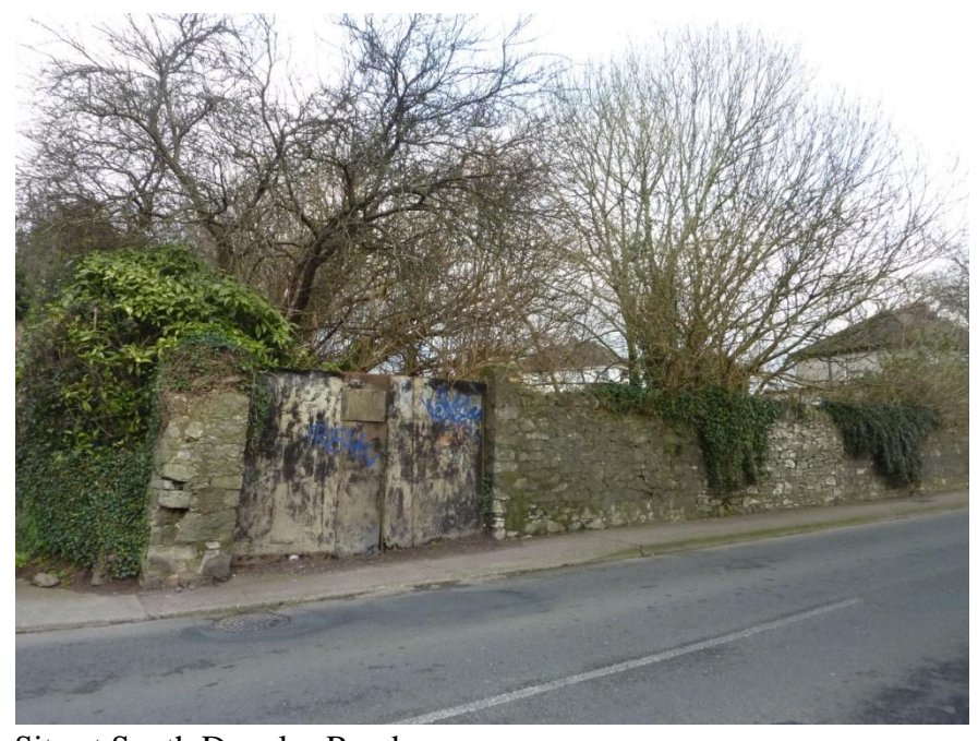
Site at South Douglas Road