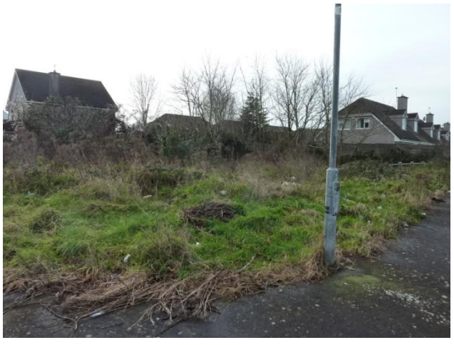
Site between Ballyoon and 9 Ashwood