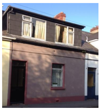
17 South View