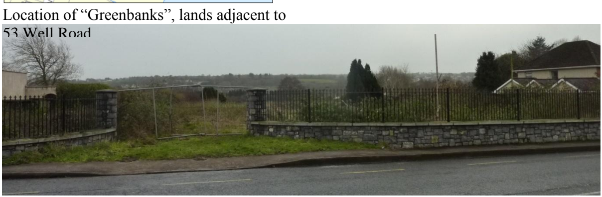
"Greenbanks", lands adjacent to 53 Well Road