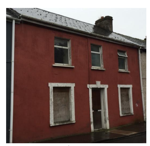
4 Convent Road