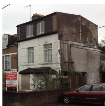
35 Victoria Avenue