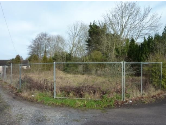
Shell Cottage, Skehard Road