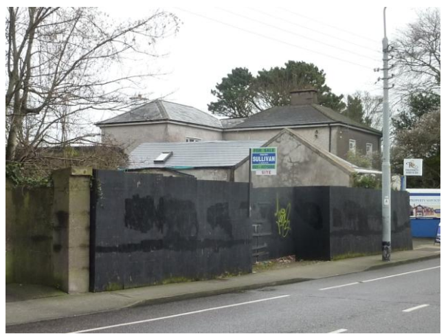
79 Douglas Road