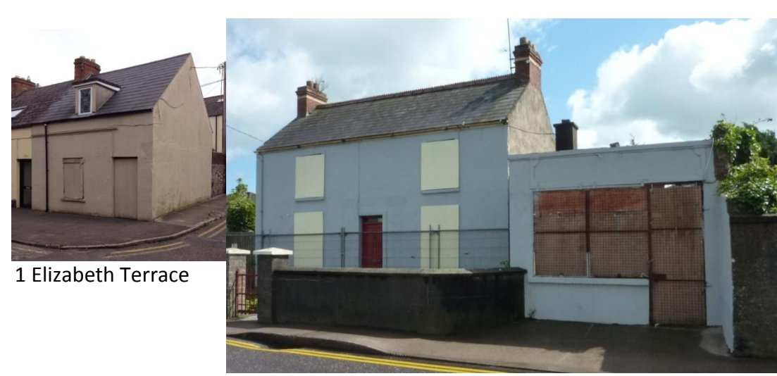
Emyville, Ballinlough Road 30