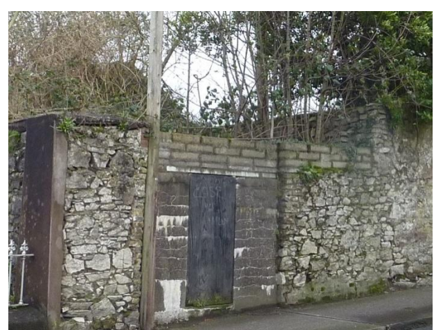
Site adjacent to 2 Ashton Cottages