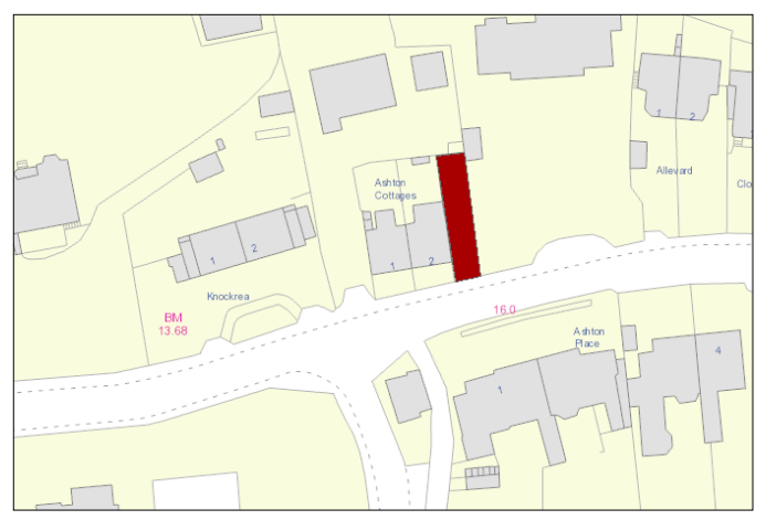
Location of site adjacent to 2 Ashton Cottages