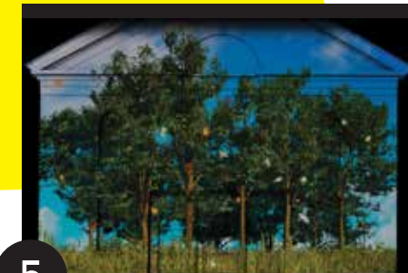
5 Tempus Futurum By Brian Kenny — Triskel Christchurch

Urban Mirror is a beautifully crafted large table with an atmospheric globe light that provides a sculptural pavilion in a cultural corner of the city centre and a warming glow when the sun sets. A space intended to be used by the public to talk, eat, play and interact, it was inspired by the street's vibrant history as a market-place. Made of durable and playful stainless steel, the freeform table can seat up to 50 people.