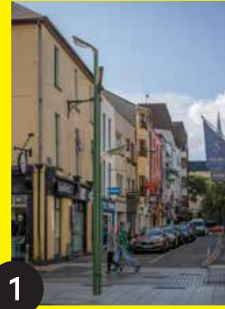
1 Boom Nouveau By Forerunner — Cook Street

Boom Nouveau mimics the form of a tangible everyday urban street feature – the lamppost. The name refers to the rupture of the artwork emerging from the ground, with a nod to the influence of the craftsmanship of art nouveau. Created using historic methods of production with familiar building materials alongside hand-blown glass and cast bronze, the sculpture shines a light on the city and encourages people to look up and explore the architecture as they navigate through the city.