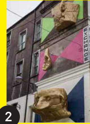
2 The Face Cup By Fiona Mullholland — The Exchange Building, Princes Street

Boom Nouveau mimics the form of a tangible everyday urban street feature – the lamppost. The name refers to the rupture of the artwork emerging from the ground, with a nod to the influence of the craftsmanship of art nouveau. Created using historic methods of production with familiar building materials alongside hand-blown glass and cast bronze, the sculpture shines a light on the city and encourages people to look up and explore the architecture as they navigate through the city.