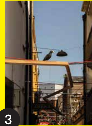
3 Sentinels [flew through the ages in the shape of birds] By Niamh McCann — Carey's Lane

The Face Cup is a celebration of Cork's rich prehistoric heritage. An artwork of large-scale sculptural reliefs, it is based on a collection of exceptional Bronze Age ceramic artefacts circa 3800 years old that were excavated by Cork archaeologists. A museum for an outdoor space, it also pays testament to the rich history and hospitality of the building and area. The artwork is handmade in styrofoam and fibreglass and painted in a gold effect.