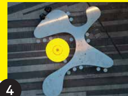
4 Urban Mirror By plattenbaustudio — Cornmarket Street

Sentinels is a lane-length sculptural piece, influenced by the architecture, geography, and migratory history of the street, a nod to the old and the new. The work, which is made with sustainable materials, is fixed above head height and held by the simple image of a seagull, perched atop a neon strip, sentinel-like. Intriguing and playful, the work animates the lane and responds to the shifting shape of the city.