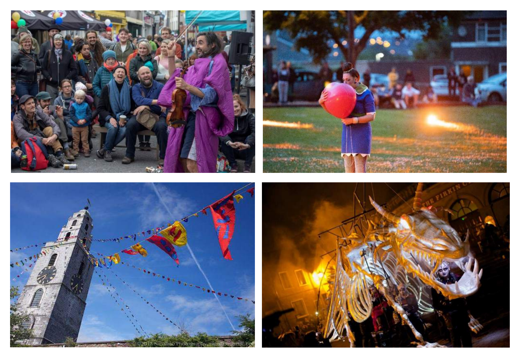
Street Arts Forms clockwise from top left: Music Performance [1], Street Theatre [2], Puppetry and Procession [3] and Installation [4].