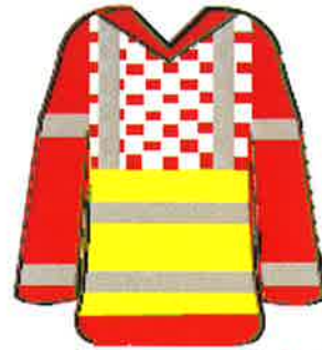
Cork City Council Controller